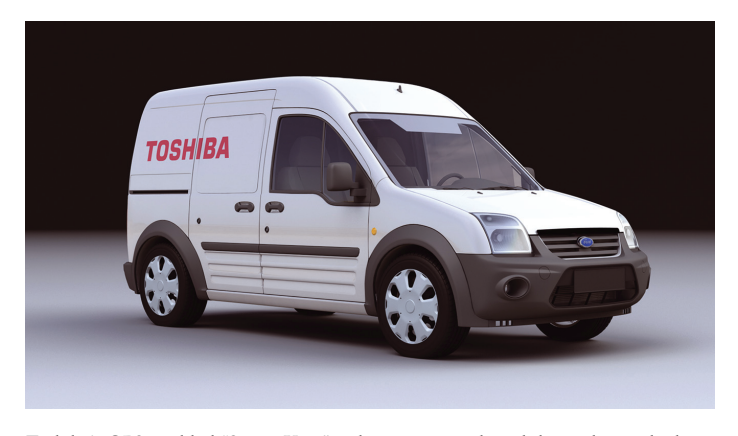
Toshiba's GPS enabled "Smart Vans" utilize proximity based dispatching which locates the closest available service technicians to your store. This provides extremely responsive on-site store maintenance service while helping reduce travel time and store technology down time.

Toshiba's 24 x 7 Warranty Coverage For "Always On" Retail Environments